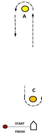
COURSE 5 and 6 DIAGRAM and ROUNDING ORDER (Not to Scale)

COURSE 2: START – A – C (or GATE) – A – C (or GATE) – A – FINISH